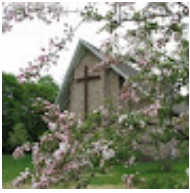
The Congregational Church in Canton, MA (left) hosted the MACCC Spring Meeting, the first in-person since COVID.