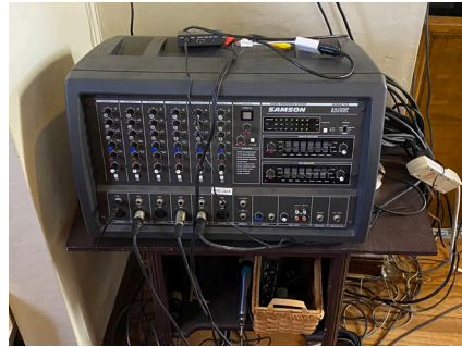
Our sanctuary amplifier, the culprit behind the whine.

Have you noticed a high-pitched screech coming from the speakers whenever it's quiet in the sanctuary? You're not the only one! Over the last several weeks, the sound has become more noticeable, and technicians have identified the amplifier as the problem.* As it turns out, we have been wanting to replace and upgrade the sound system for a while—it's more than 10 years old! We also do not have enough microphones for voices and pick-ups for instruments, the cords running across the stairs are getting to be a hazard, we need better sound for our live-stream, and the old, wireless microphones currently broadcast on what is now an emergency frequency. Pastor Doug and the Trustees are currently seeking bids for new sound systems for