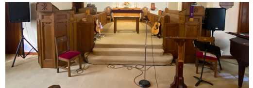
You can see some of wiring concerns in the front.

*For the curious, the whine we hear when the sanctuary is quiet is because the current amplifier is not properly shielded against the cellular antenna signal, and does not have noise removal equipment added to "scrub out" unwanted noise.